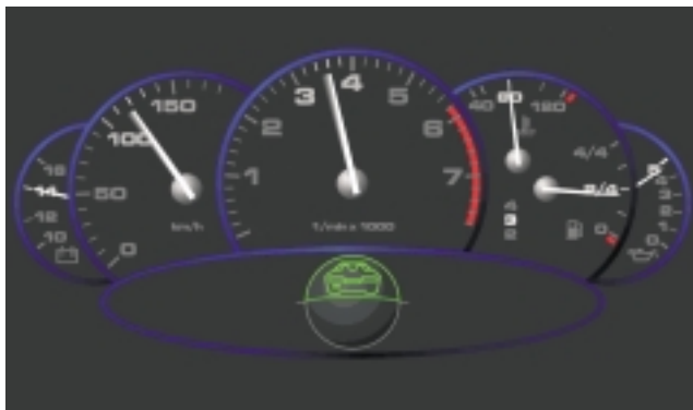
Fig. 2. Prestudy of the appearance of a Reconfigurable Instrument Cluster. The free spaces may be used to provide additional non permanent information.

Car instrumentation is one of the most important tools of passive safety. Absolutely mandatory information must be readily available on the start of the vehicle (velocity, oil/coolant/battery tests, fuel gauge). Warnings (e.g. increasing the size of the fuel gauge or the coolant temperature display) or alert situations (e.g. brake failure, drop of oil pressure) must trigger an emphasised signal. Sublimated suggestion (e.g. slow change of the background colour) may signal environmental changes, e.g. freezing road, exceeded speed limit.